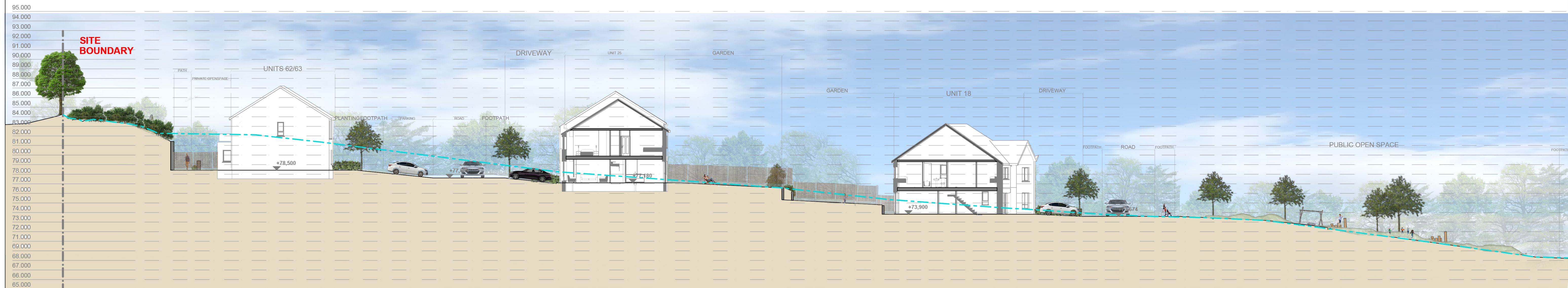
02 SITE SECTION SECTION