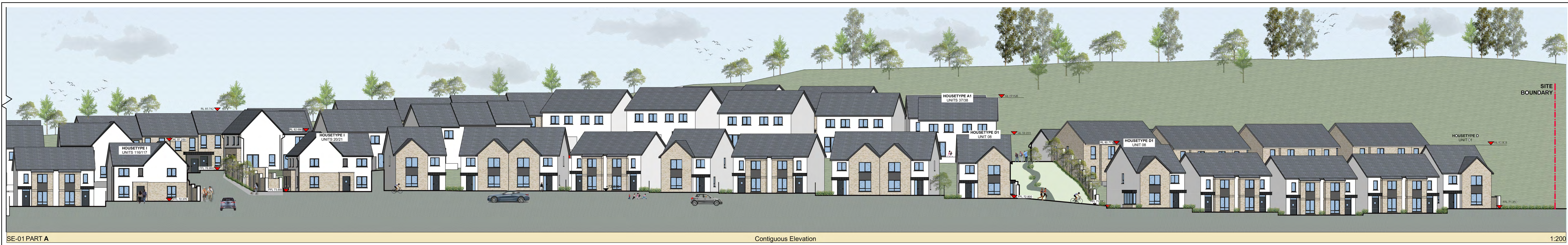
SE-01 PART A Contiguous Elevation 1:200