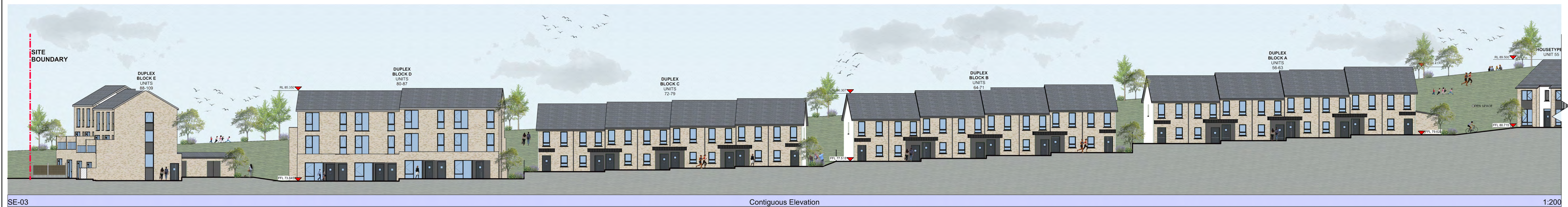
SE-03 Contiguous Elevation 1:200