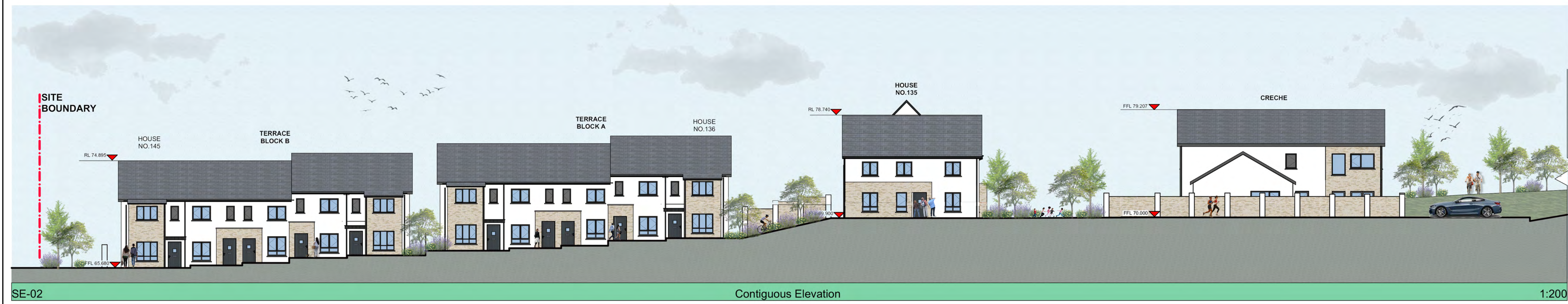
SE-02 Contiguous Elevation 1:200