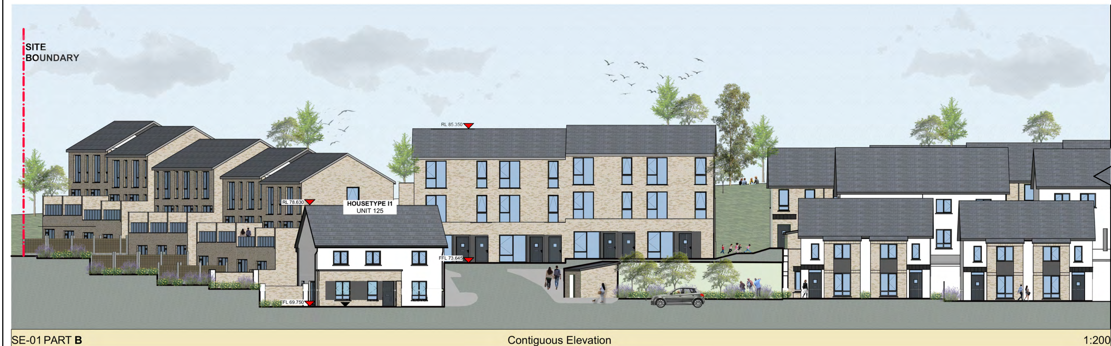
SE-01 PART B Contiguous Elevation 1:200