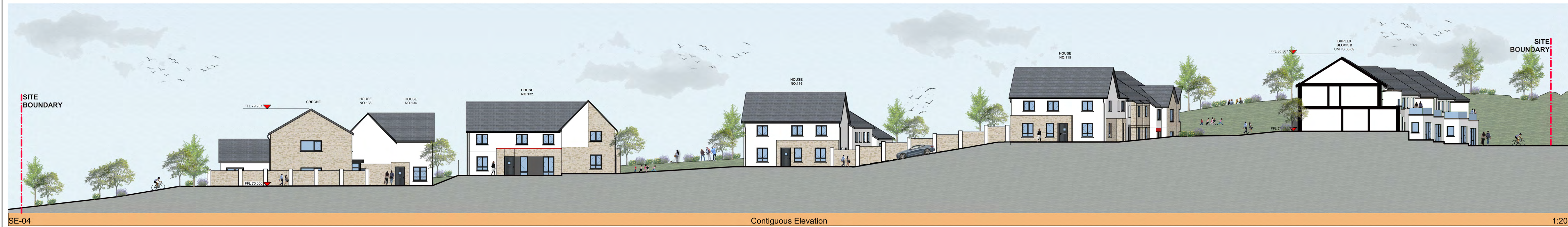
SE-04 Contiguous Elevation 1:200